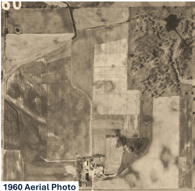
1960 Aerial Photo

The smoke house which also was used for dynamite storage disappeared under the footprint of the quonset machinery shed.