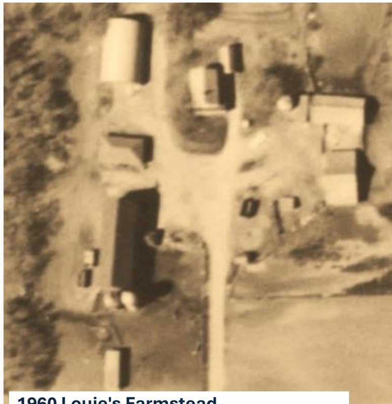
1960 Louie's Farmstead