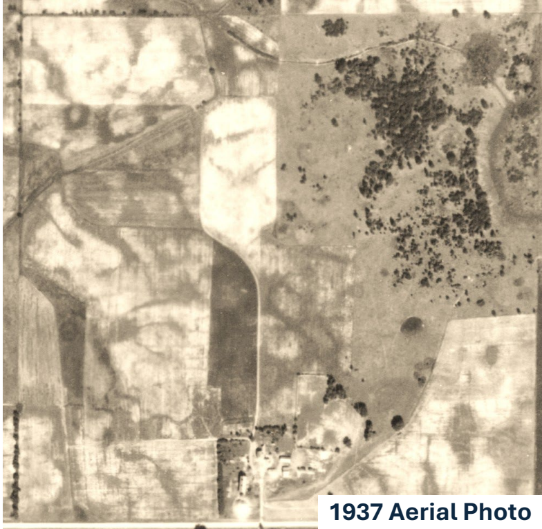
1937 Aerial Photo

The aerial photo on the page was taken in 1937.