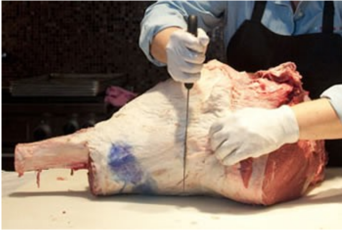
Round/rump. This is the top of one of the rear legs and several cuts, mostly roasts, come from the round.