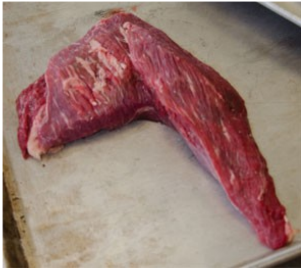
Tri-tip. Click for a recipe