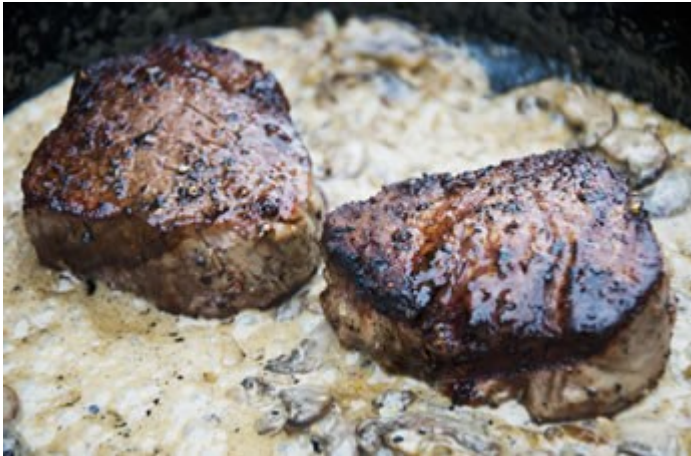
Filets Mignon from the chateaubriand, in a mushroom cream sauce.