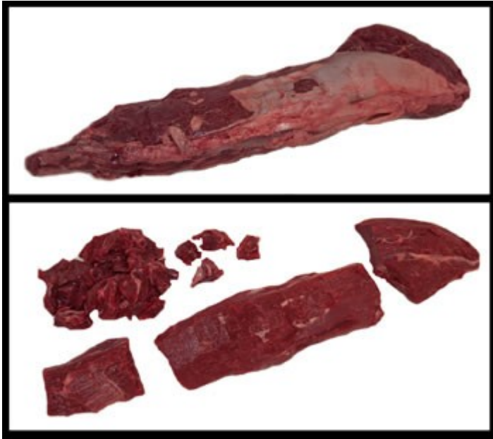
Whole tenderloin (top), butchered into chateaubriand, two steaks, and stir fry meat (bottom).