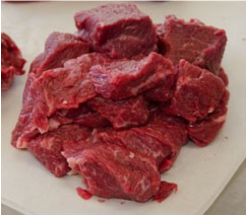
Beef cubes for kabobs or spiedies from bottom sirloin, but they can come from many cuts.