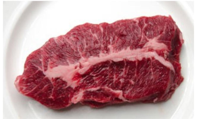
Flat-iron Steak. From the shoulder, the meat is flavorful and tender, but that strip of gristle is tough.