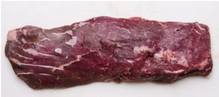
Las Vegas Strip Steak, from the chuck.