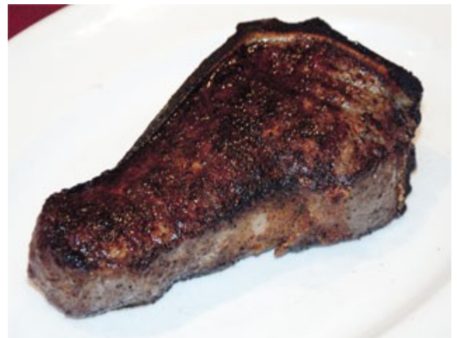
Bone-in strip steak.

Two loin primals with two porterhouses facing us. At the bottom are the filets, on the top are the strips. If they were joined, they would be called a saddle of beef.