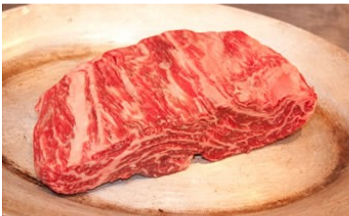
Rib cap from American Wagyu beef.