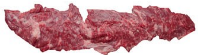
Skirt steak (fajita steak).