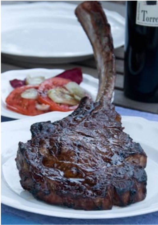
Cowboy ribeye, a.k.a.tomohawk ribeye