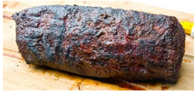
Chateaubriand (from the center of the tenderloin).