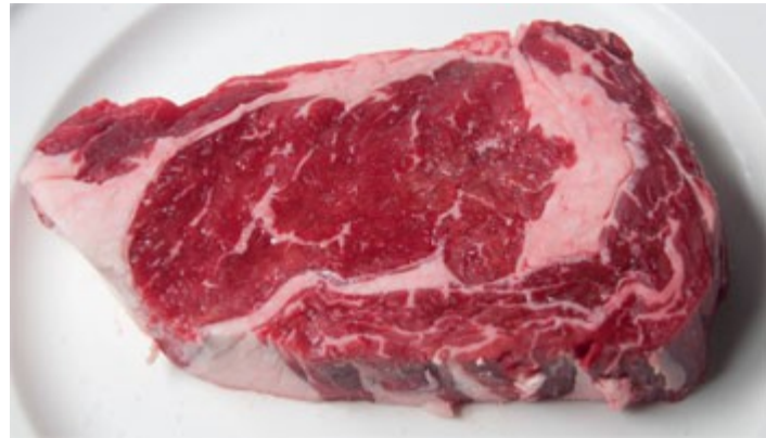
Boneless ribeye. Eye is in center, rib cap on the right and bottom. Click here for steak cooking tips.