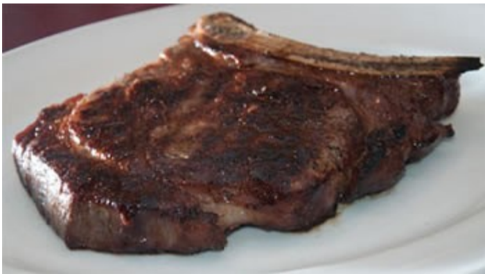
Bone-in ribeye. Click here for steak cooking tips.