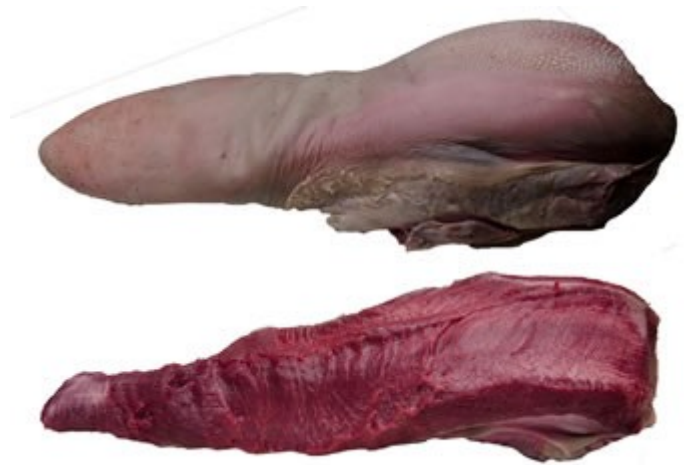
Tongue with its skin (top), without (bottom)