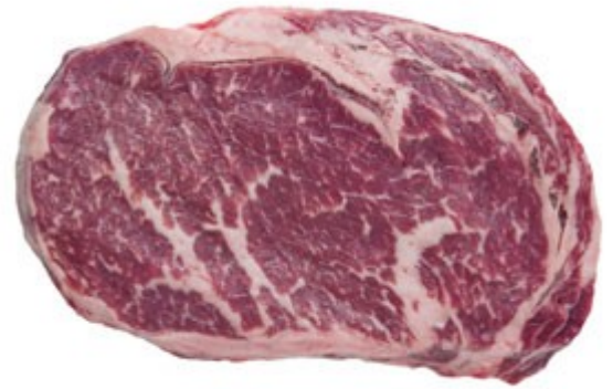
Eye of ribeye.