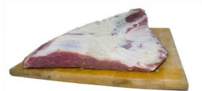
Whole packer brisket. Click here for my Texas Brisket recipe.