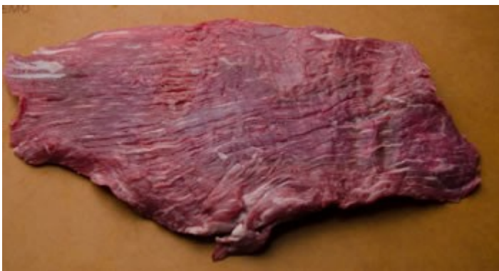
Flank steak. Click for a recipe.