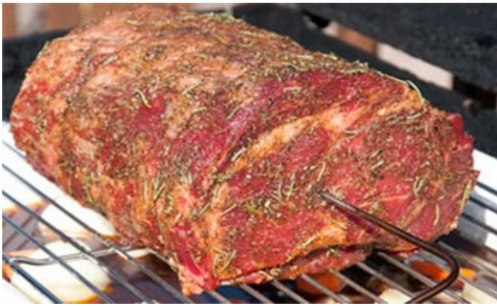
Boneless rib roast. Click for a recipe.