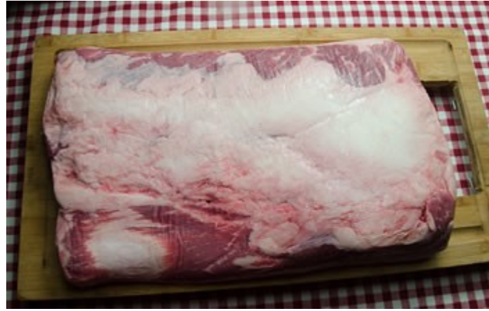
Navel is most often used for pastrami. Click here for a recipe for making pastrami.