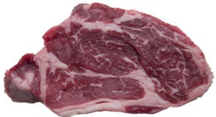
Chuck-eye. Click here for more about the various cuts of chuck steaks.