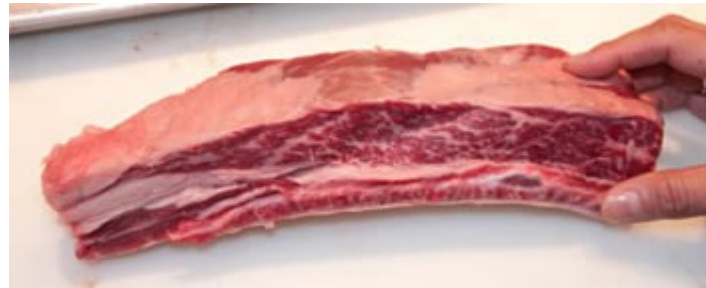
Beef short rib. Click the link for pictures of other rib