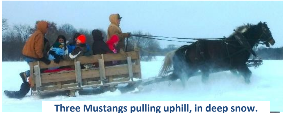
Three Mustangs pulling uphill, in deep snow.