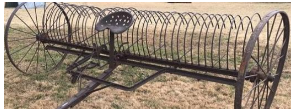
Obsolete Dump Rake with Steel Wheels

I used to say that I have never legitimately been thrown, but that is not true. If not that, I would like to say I got back on until every horse was broke, but actually, that is not true either.