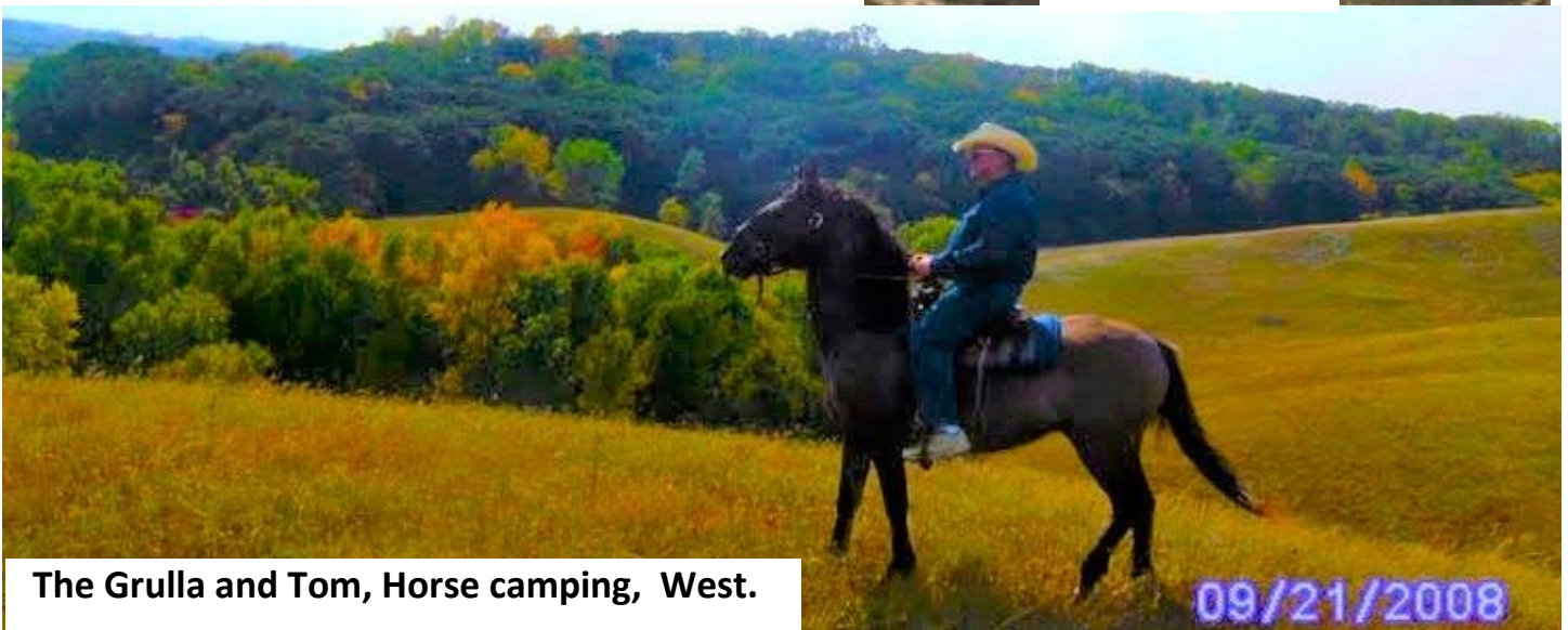
The Grulla and Tom, Horse camping, West.